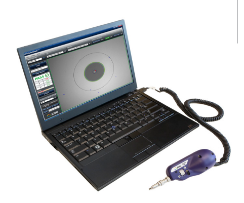
Laptop not included.