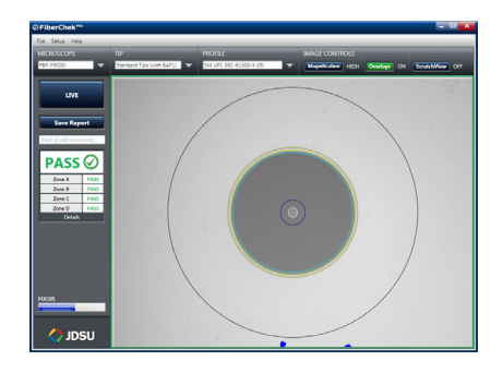
FiberChekPRO User Interface